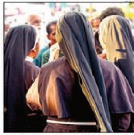
This is like a disciplinary action against us, said one of the nuns. This is a ploy to torpedo the case and isolate the survivor, she said