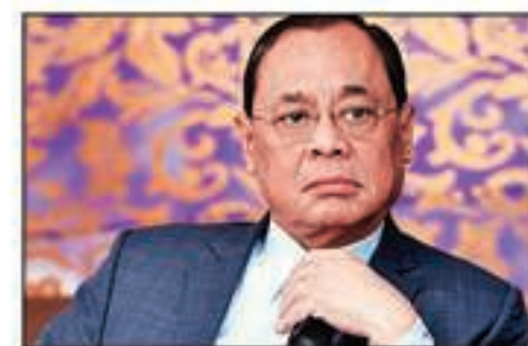
CJI Ranjan Gogoi

The committee, by a 2-1 majority, upheld divestment of Verma's powers after going through the preliminary inquiry report of CVC on alleged corruption charges against him.