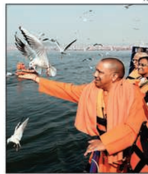
Yogi feeding birds on the banks of Ganga during Kumbh Mela

Sharply reacting to the government dole for seers, SP chief and former CM Akhilesh Yadav said, "The govern-