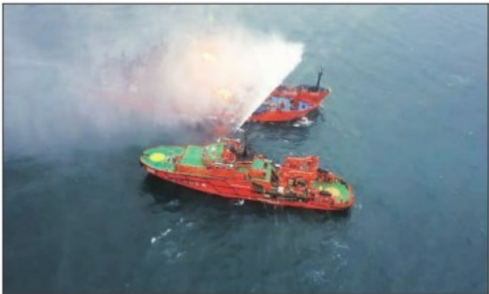
A rescue vessel during a fire-fighting operation following an accident involving two ships, which caught fire in the Kerch Strait, near the coast of Crimea.

ring fuel from one to the other. One of the ships, the Candy , had a 17-member crew, including nine Turkish citizens and eight Indians. The other one, the Maestro , had a 15-member crew, including seven Indian nationals, seven Turkish citizens and an intern from Libya, Russian news agency