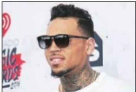
A woman alleged that she was raped at Brown's hotel room in Paris on Jan 15.

US SINGER Chris Brown was arrested in Paris on Monday with two other people on suspicion of rape, a French police source said. The arrests were first reported by Closer magazine, which said Brown, his bodyguard and a friend were detained after a 24-year-old woman alleged she was raped at the singer's suite at the Mandarin Oriental hotel on January 15. The woman said she had met the men at a Paris nightclub ear-