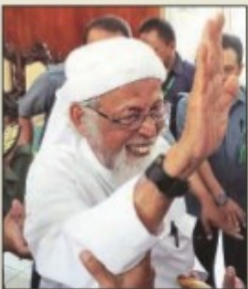
Abu Bakar Bashir has been linked to the 2002 Bali bombings

Jakarta: Indonesia's President said a radical Muslim cleric linked to the 2002 Bali bombings would only be released from jail if he pledged loyalty to the state and its ideology, after news he would be freed unconditionally sparked criticism. President Joko Widodo had declared last week that Abu Bakar Bashir, 81, would be freed on humanitarian grounds, citing his age and poor health. A legal adviser to the President had said the cleric would be granted unconditional release. But Widodo said in a statement on Tuesday it would be "conditional release", a day after a minister said the decision was being reviewed.