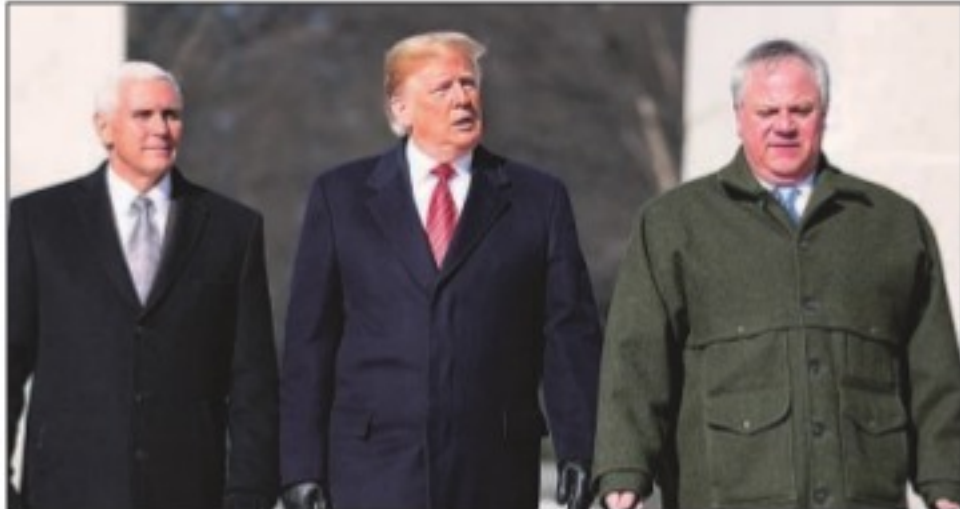
Trump with US Vice President Mike Pence and acting Secretary of Interior David Bernhardt at the Martin Luther King Memorial in Washington on Monday.

DEMOCRATS IN the US House of Representatives have quietly tweaked a rule on taking secret depositions that is likely to give a boost to their investigations of President Donald Trump, his personal finances and his administration. The little-noticed change, made since the Democrats took over majority control of the House earlier this month, will let staffers of House investigative committees take testimony from subpoenaed witnesses without a lawmaker being present. By eliminating complications with lawmakers' schedules, the change will let staffers work faster and range more widely, said former staffers and sources inside the committees that are launching several inquiries into Trump and his presidency. The importance of this was underscored, legal experts said, when attorney general nominee William Barr indicated last week that he was unlikely to release the final report from Special