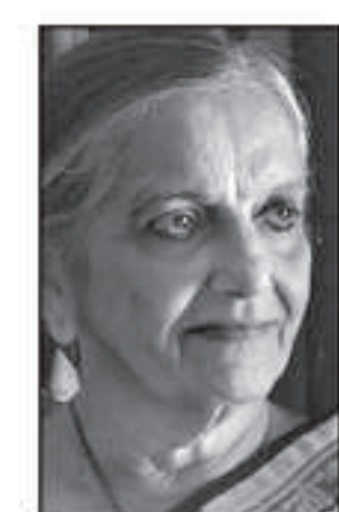
FLAVIA AGNES Indian women's rights lawyer

protect nature. The economy, for instance, is a wholly owned subsidiary of the environment and the only way we can survive the challenges of human-induced climate change is to work collectively to regenerate ecosystems, which will harvest water, control floods and droughts, add fertility to our farms and supply us with pure water all through the year. By working at the tri-junction of biodiversity, economics and climate change, we have some hope. If we allow economic objectives to destroy biodiversity, we stand no chance of survival on our climate-wounded planet.