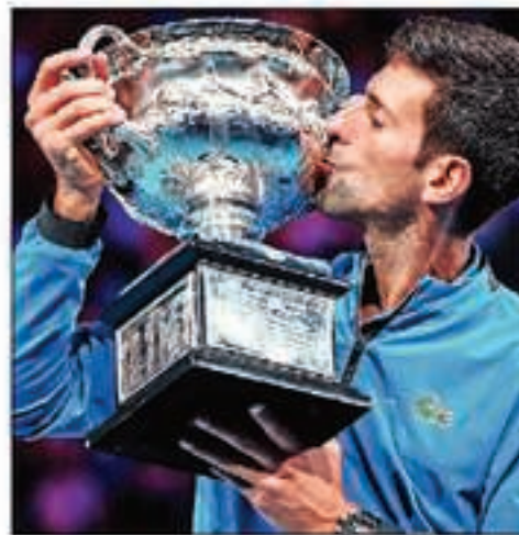
Djokovic with the trophy

He added: "I'm a true believer in visualization. I had to do it 12 months ago after the surgery because I wasn't playing well, I wasn't feeling good on the court, I was ques-