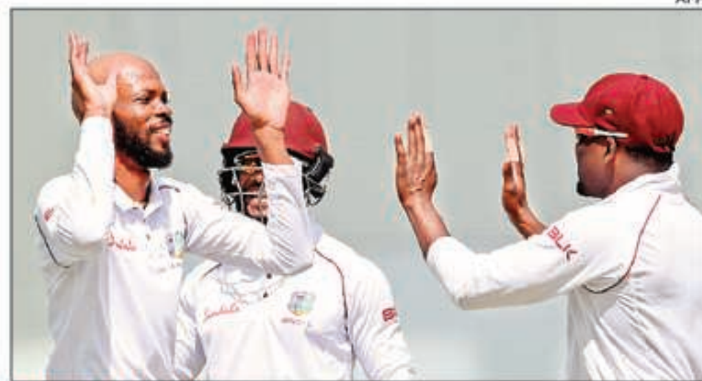
UNLIKELY ASSASSIN: Chase (left) celebrates an England wicket

Chase joined an elite list of West Indies' bowlers with eight wickets or more. He did not extract a great deal of turn from the Kensington Oval pitch in Barbados, but flighted