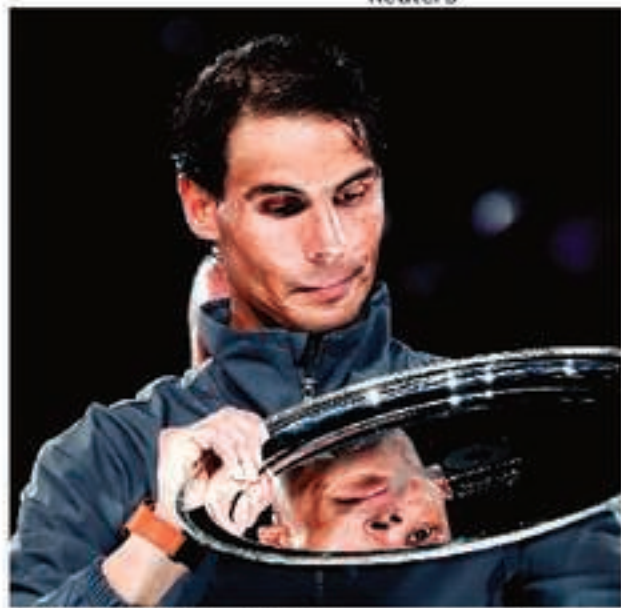
Rafael Nadal with the runner-up trophy

The French pair beat Henri Kontinen of Finland and John Peers of Australia 6-4, 7-6 (1) in the final. Herbert and Mahut now own four major doubles titles. They won the US Open in 2015, Wimbledon in 2016 and the French Open in 2018. AP