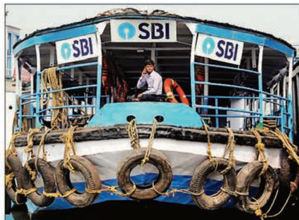
CHOPPY WATERS? SBI officials have alleged that data of the Unique Identification Authority of India has been misused