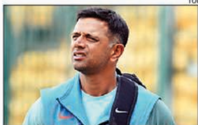
WIDE VISION: Rahul Dravid