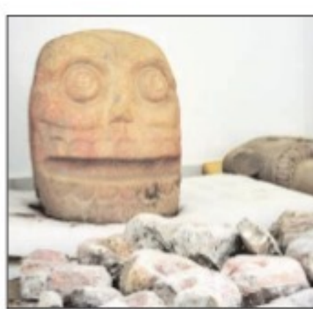
Astone carving depicting Xipe Tótec, the Flayed Lord.

the time of the Spanish invasion in the early 1500s, say that worshippers of Xipe Tótec sacrificed people, usually prisoners of war, by having them fight a series of combatants in a kind of gladiatorial ritual — or by killing the prisoners with arrows. The worshippers then flayed the victims, and priests were said to have worn their skin.