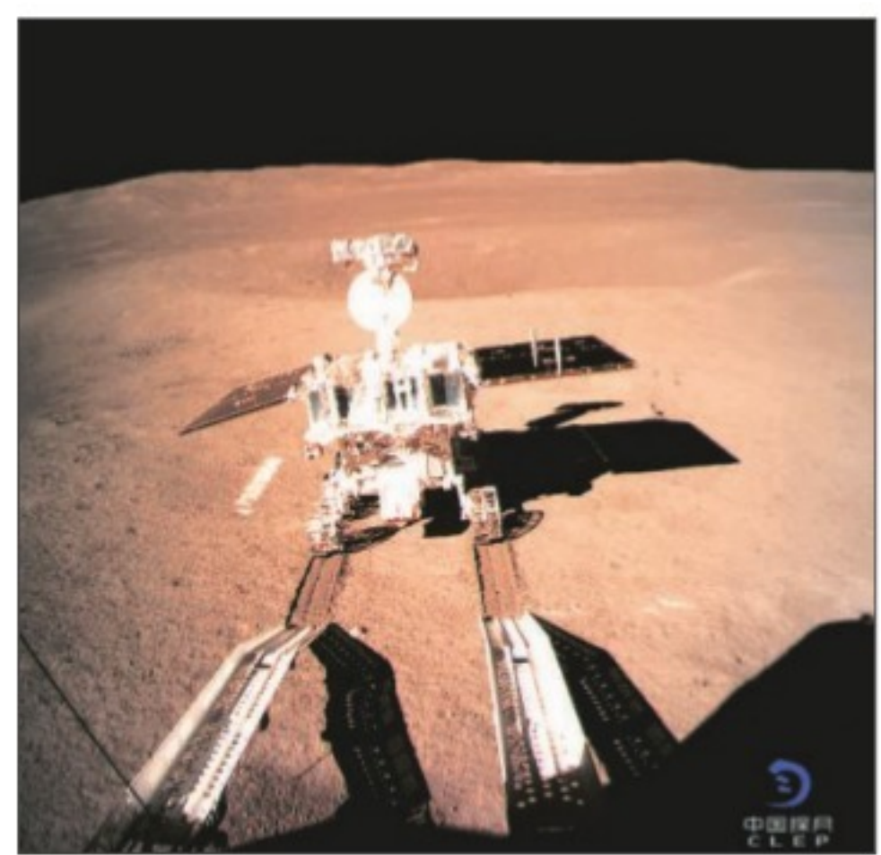
FARTHEST FOOTPRINTS: China's lunar rover leaves wheel marks after leaving the lander that touched down on the far side of the Moon on Thursday. These are the first 'footprints' on the far side of the Moon.