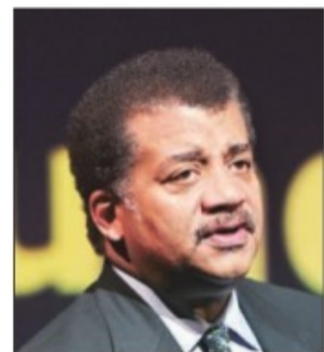
Neil deGrasse Tyson

Last December, National Geographic Networks and Fox said they would examine claims that Tyson behaved in a sexually inappropriate manner toward