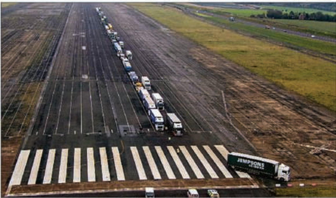
Trucks parked at Manston Airfield during a test for a 'no-deal' Brexit

London: Britain is testing how its motorway and ferry system would handle a no-deal Brexit by sending a stream of trucks from a regional airport to the port of Dover—even as some legislators try to pressure the government to rule out the scenario. The tests began on Monday morning and are intended to gauge how severe the disruption would be if Britain leaves the European Union on March 29 without an agreed upon withdrawal deal. It is expected that an abrupt departure without a deal would lead to the introduction of tariff and customs barriers that would slow fast-moving ferry and rail traffic that links Britain to continental Europe. There are concerns that major traffic jams leading into and out of ferry ports like Dover could greatly hamper trade and leave Britain without adequate food and medicine. Parliament is expected to resume its debate over the government's planned withdrawal deal on Wednesday, with a vote tentatively scheduled for early next week. There are no indications that lobbying over the holidays has garnered Prime Minister Theresa May more support for her plan, which has sparked wide opposition in Parliament. A vote that had been scheduled in November was delayed as May admitted it would face certain