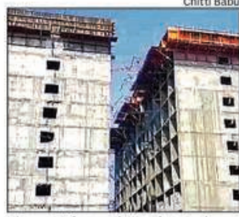
The spot from where the workers fell to their deaths

While four of them died instantly, one died in the hospital. The condition of the injured