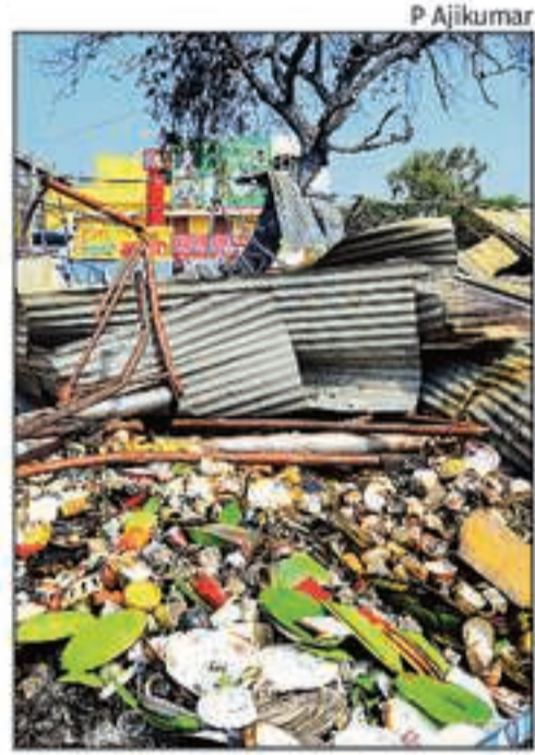
The damaged goods a day after the fire at Numaish in Nampally

In the 2019 edition, the Exhibition Society, which organises the All India Industrial Exhibition, granted over 2,500 stalls to traders to showcase and sell their wares and services during the 45-day annual fair. "In the rules and regulations prescribed in the booklet we have clearly mentioned (Rule No 8 of Obligations, Re-