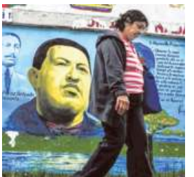
A painting of Hugo Chávez in Caracas.

It does not change EU policy, but adds to calls for the EU executive and its member states to join the United States, Canada and Brazil in backing Mr. Guaidó. Four major European member