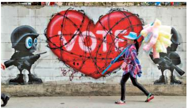
Towards democracy: Graffiti in Bangkok ahead of the Thai general election in March.

Facebook said in a newsroom post it would help "protect" the Thai vote by temporarily not allowing ads from "foreign entities which