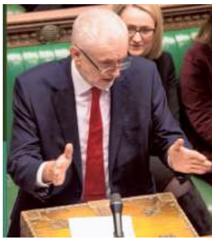
Seeking common ground: British Prime Minister Theresa May and Opposition leader Jeremy Corbyn speaking in the House of Commons on Wednesday.

a magic solution — in the next few days in order to have this ratified in due time," she told BBC radio.