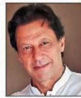
PM Imran Khan

In September, Pakistan had decided to seek a bailout package to avoid default on its international debt obligations. But things could not move in the desired direction as the Pakistan Tehreek-e-Insaf government was unwilling to