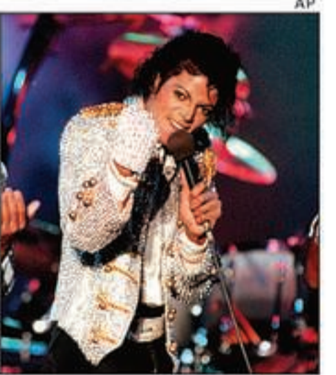
Denmark's oldest mall feared MJ's wax statue could offend customers and may be vandalised because of accusations that the late pop star molested boys

Copenhagen: Denmark's oldest shopping mall has removed a wax statue of Michael Jackson out of fears it could offend customers and may be vandalised because of accusations that the late pop star molested boys.