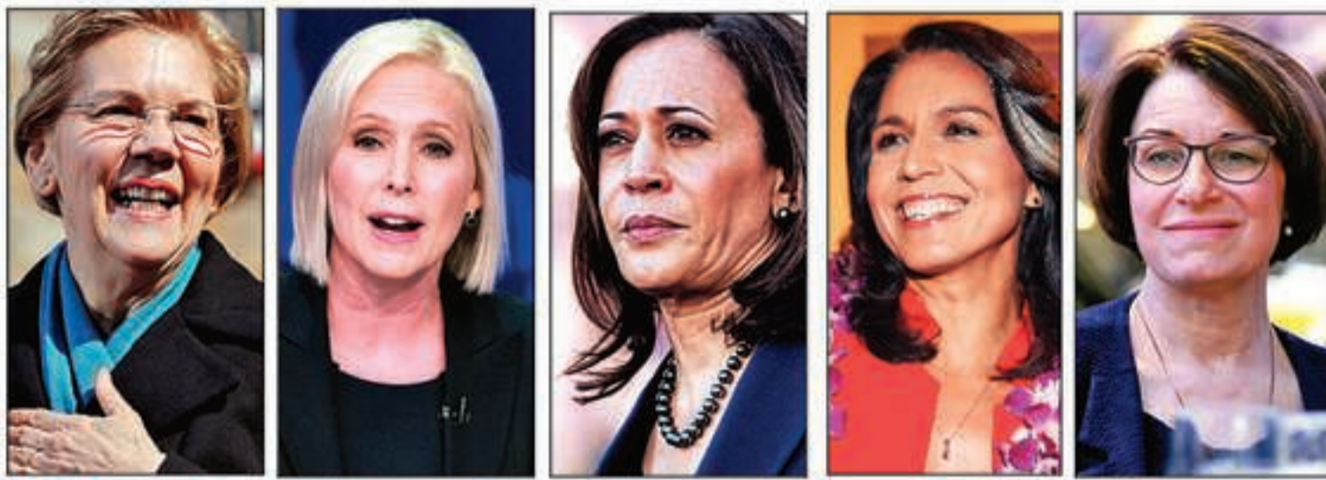
FEMME FETTER: Elizabeth Warren, Kirsten Gillibrand, Kamala Harris, Tulsi Gabbard and Amy Klobuchar (left to right) are all vying for the 2020 Democratic presidential nomination