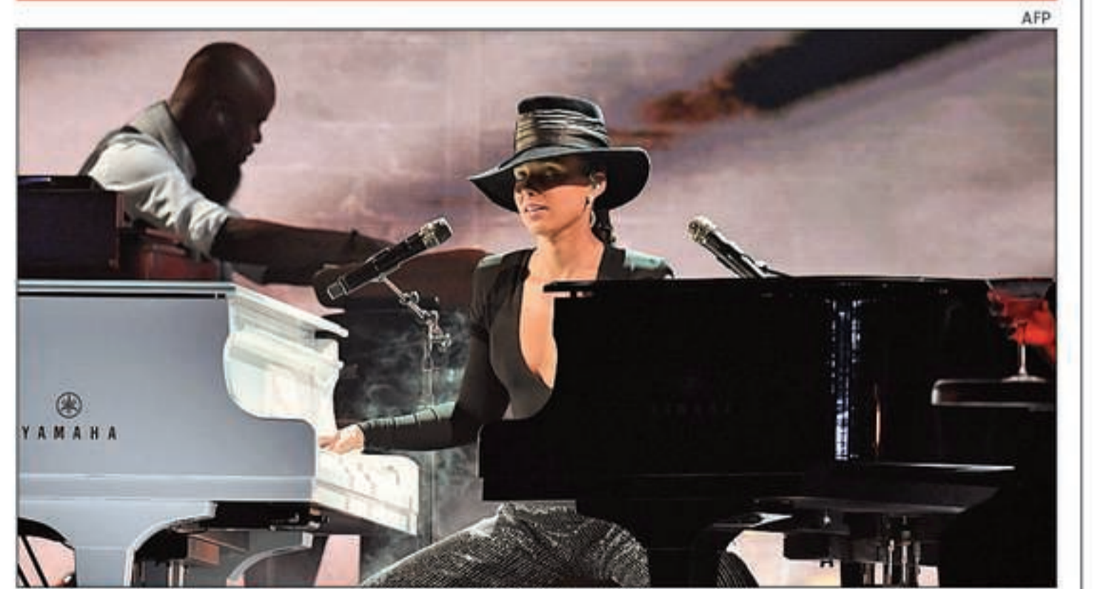
STRIKING THE PERFECT CHORD: Flanked by two pianos, singer-songwriter Alicia Keys performs during the Grammy Awards in Los Angeles on Sunday. She was the first female host of the show in 14 years