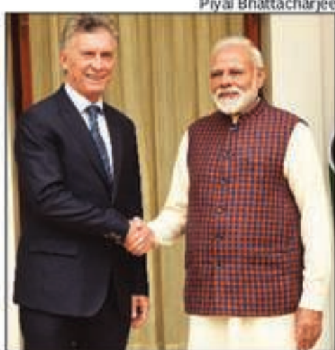
Argentina President Mauricio Macri with PM Narendra Modi in New Delhi