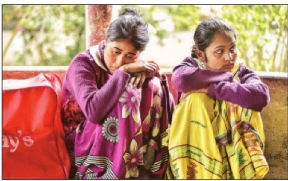
Grieving relatives of a victim in Golaghat on Saturday.