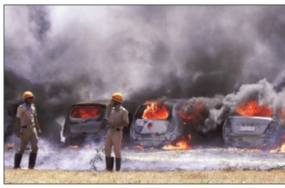
150 CARS CHARRED Firefighters at Aero India 2019 in Bengaluru on Saturday, where about 150 vehicles were gutted in the parking lot outside the Yelahanka Air Base. REPORT, PAGE 9

The Little Kashmiris Many parts of India still hold out the promise of hope, dreams that first drew Valley students