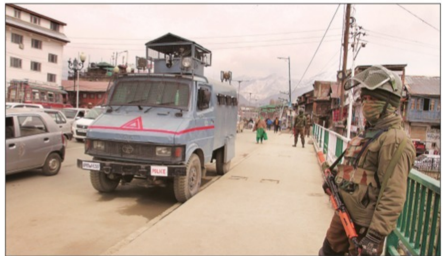
Security personnel at Lal Chowk in Srinagar on Saturday. MORE REPORTS, P 10

Says Valley residents also victims of terrorism