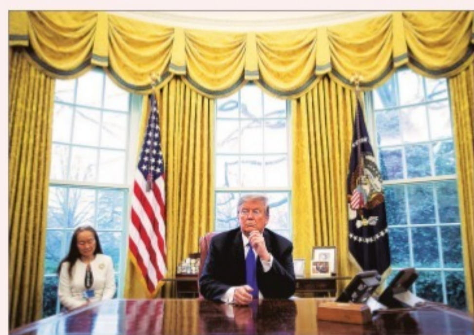
Chinese trade delegation led by vice premier Liu He, Trump described the current situation between India and Pakistan as very dangerous

Claims to have developed a much better relationship with Pakistan even after he stopped $1.3 bn in financial aid to Islamabad