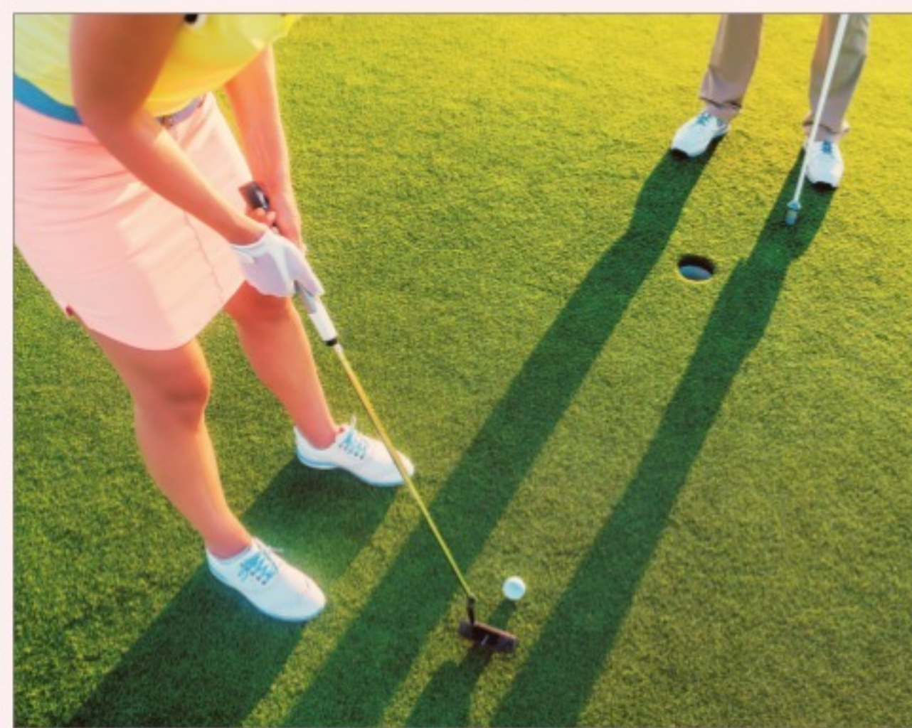
New Rules Guidelines in 2019 stipulate that not even your caddy is allowed to help you line up putts

Damaged your club? We've all done it, whether in frustration or by accident. Now,