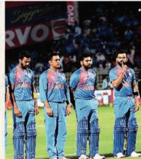
RESPECT: Virat Kohli tells fans to be quiet as the teams pay tribute to Pulwama victims

1 Lokesh Rahul's first fifty vs Australia is his fifth in T20Is - all five while opening the innings. His two tons have come batting at No. 3 and 4.