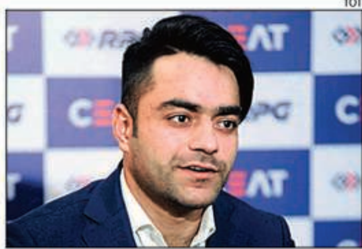
TRICKSTER: Rashid Khan