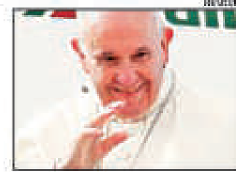
Pope Francis will lead an open-air mass for around 1.35,000 Catholics — set to be the largest gathering ever in the UAE

Abu Dhabi: Pope Francis arrived in the United Arab Emirates (UAE) on Sunday for the first visit by a pontiff to the Arabian Peninsula, where he will meet with Muslim and political leaders and celebrate an outdoor mass in the capital Abu Dhabi.