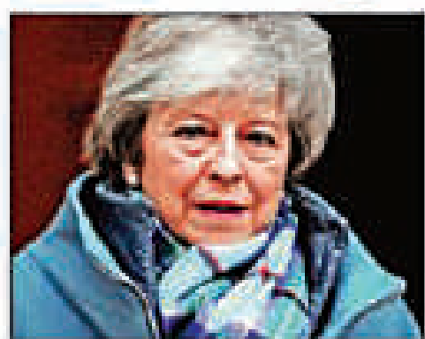
The panic has set in after British PM Theresa May failed to get support for her negotiated divorce deal and the EU refuses to budge on the Irish backstop issue

London: British PM Theresa May's Brexit strategy took another blow on Sunday when Nissan cancelled plans to make its new SUV in northern England amid continued uncertainty over the country's future relations with the European Union.