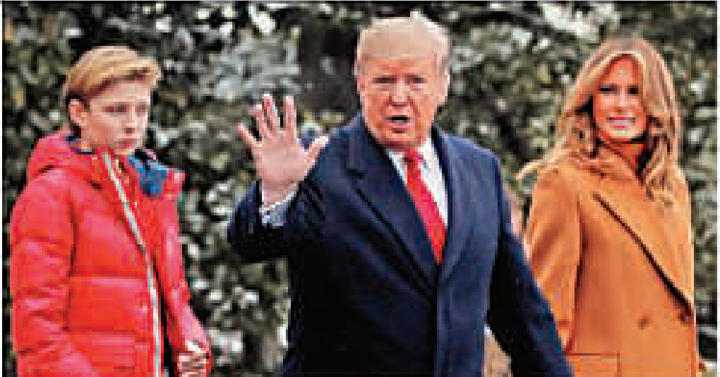
ON SON BARRON PLAYING GRIDIRON (AMERICAN) FOOTBALL | It's a tough question. If he wanted to? Yes. Would I steer him that way? No, I wouldn't... He's liking soccer... but it's a dangerous sport

In an interview to a channel, US President Donald Trump speaks about football, his foreign policy and special counsel Robert Mueller's probe