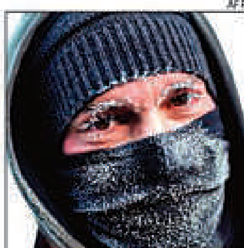
In Chicago, mercury dipped to as low as -30° Celsius this week

As temperatures plunged to life-threatening lows this week, more than 100 homeless people in Chicago unexpectedly found themselves with food, fresh clothes and a place to stay after a local real estate broker intervened.