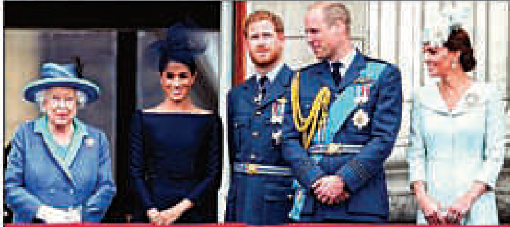
A UK paper on Sunday reported that plans were being made to move the royal family, including Queen Elizabeth, to safe locations away from London

London: British officials have revived Cold War emergency plans to relocate the royal family should there be riots in London if UK suffers a disruptive departure from the European Union next month, two Sunday newspapers reported.