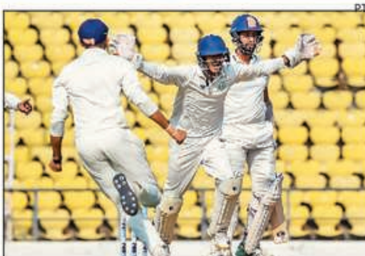
THE BIG CATCH: Vidarbha players celebrate the dismissal of Cheteshwar Pujara (right) on Monday