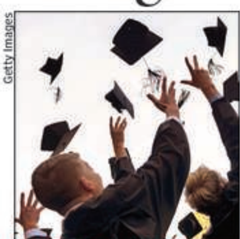
IN CASE OF EMERGENCY

India had this year made similar registration mandatory for those seeking work in 18 countries — UAE, Afghanistan, Bahrain, Indonesia, Iraq, Jordan, Kuwait,