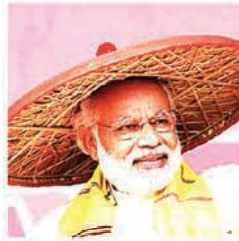
AMID CITIZENSHIP ROW

RJD, on the other hand, is targeting the consolidated OBC votes in line with the 2015 assembly polls, when Nitish Kumar led JDU was part of the grand alliance, with the demand to raise the OBC quota. It has launched a campaign, Berojgari Hatao, Aarakashan Badhao (end unemployment, raise reservations), to promote the Mandal politics. "In Bihar, reservation is a sensitive issue. Opposition parties, particularly RJD, is spreading misinformation about NDA that it has given 10% reservation to the upper castes which is 15% of the population in the state," a source in Bihar BJP said. "We are highlighting the 10% EWS reservation as one among the central government's many achievements. BJP is careful about its image as a party of upper castes in the state."