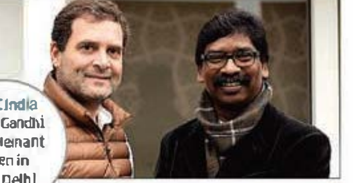
Cong, NCP May Give 8 Seats to Other Allies

The Congress and JMM "are united in the fight to save democracy", said Gandhi, while announcing the alliance on his Facebook page.