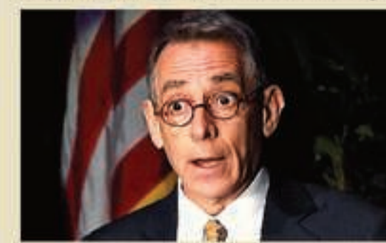
Gavin de Becker

For most people seeking de Becker's advice, they can buy peace of mind for a few dollars with a paperback copy of his best-seller, The Gift of Fear. NYT