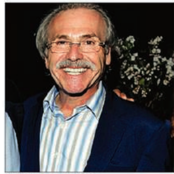
AMI CEO David Pecker