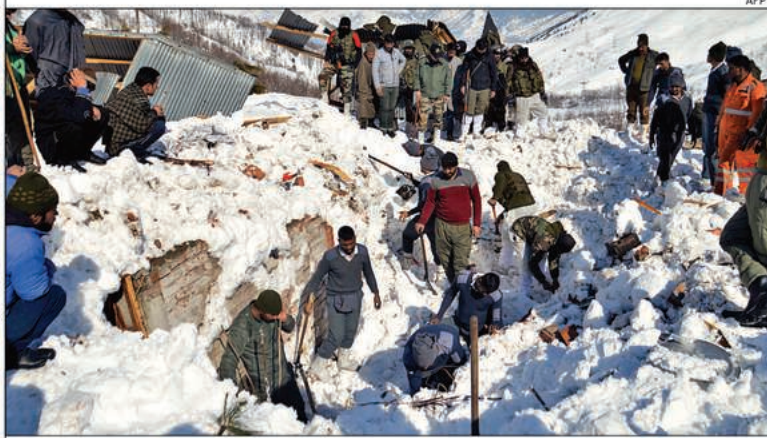
Even as policemen, helped by villagers, found bodies of seven colleagues who were buried in an avalanche in Kulgam (above) on Thursday, nine more people were buried in two avalanches in Lahaul and Spiti on Friday as the season's heaviest snowfall crippled life in Himachal Pradesh, with even lower areas like Mandi witnessing snowfall after three decades. All the nine who were buried were rescued successfully