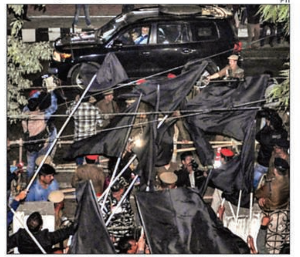
All Assam Students' Union activists show black flags to PM Modi in Guwahati on Friday to protest against the Citizenship Amendment Bill

Despite a light drizzle, groups of Aasu activists waved black flags and shouted anti-Modi slogans as the PM's convoy passed by their office to reach Raj Bhavan. In a swift