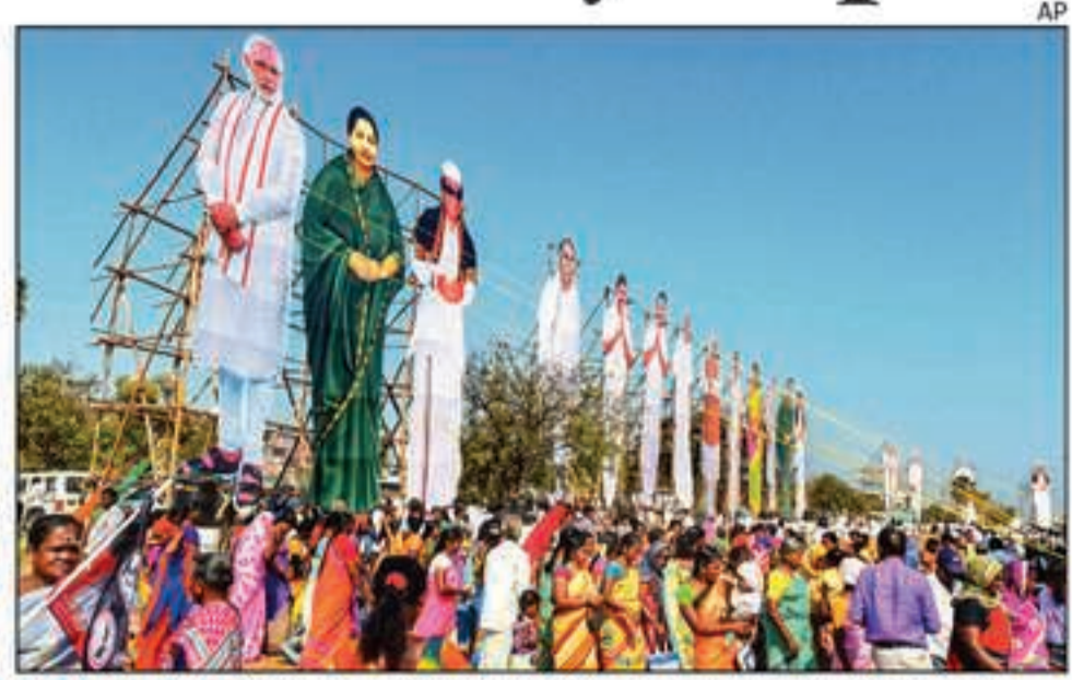
POLL-READY: Cutouts of PM Narendra Modi, late AIADMK leader J Jayalalitha and other leaders during a rally in Chennai recently