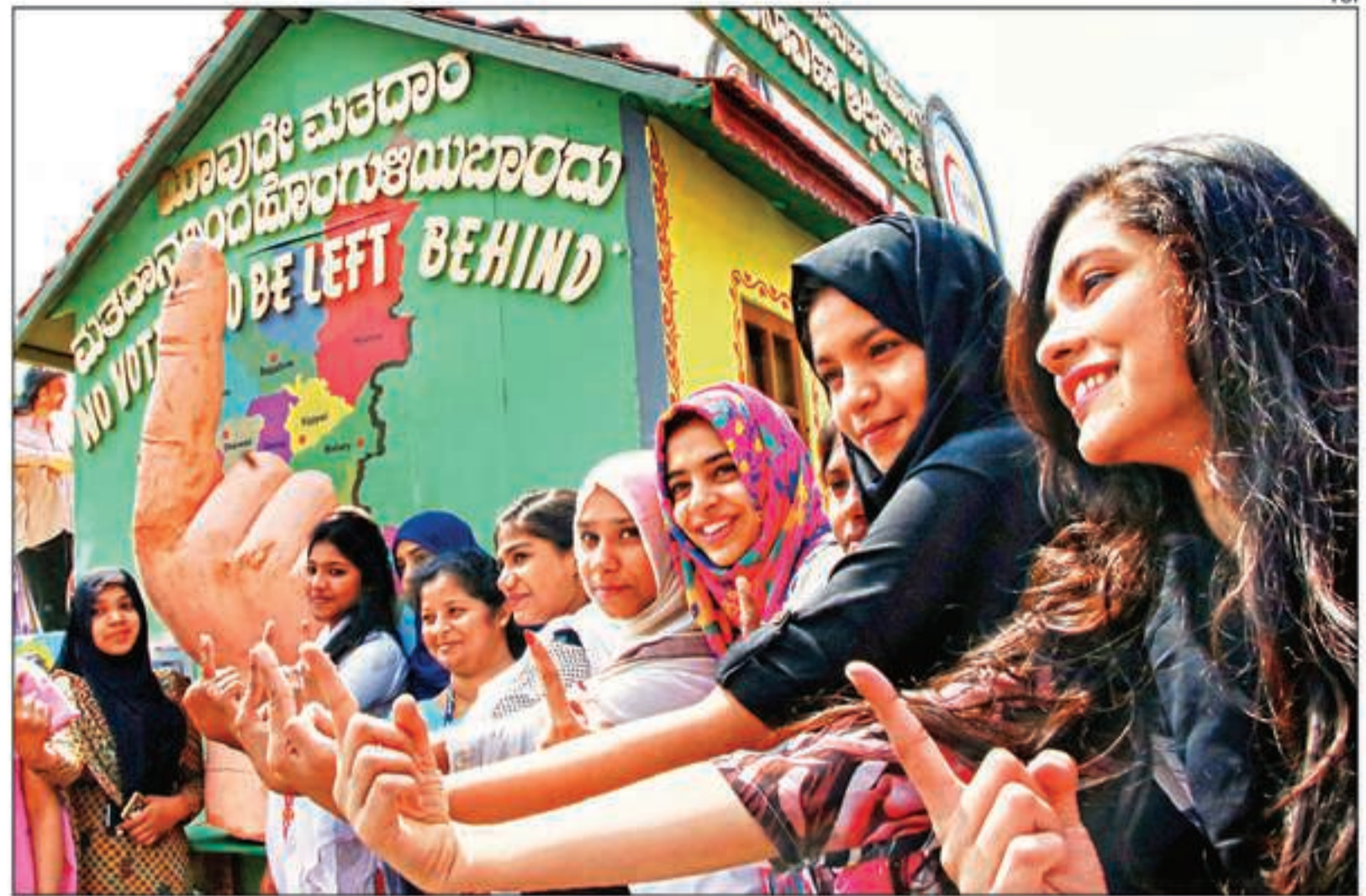
RARING TO GO: Students at a National Voters Day function in Bengaluru recently

18 assembly bypolls hold key to power in TN