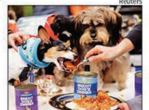
Protesters on Sunday staged a 'Brexit Dogs Dinner' — a play on the idiom that means making a mess of something — in London

Just 18 days before the UK is due to leave the EU on March 29, there is still no ratified divorce deal and talks with the bloc have stalled as May tries to break the political deadlock in London. May's spokesman said a "meaningful" parliamentary vote on her deal would go ahead on Tuesday, even though