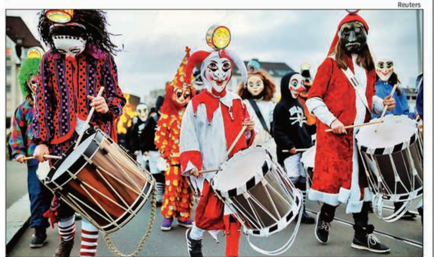
Revellers play drums during the traditional Morgenstreich parade in Basel, Switzerland, on Monday