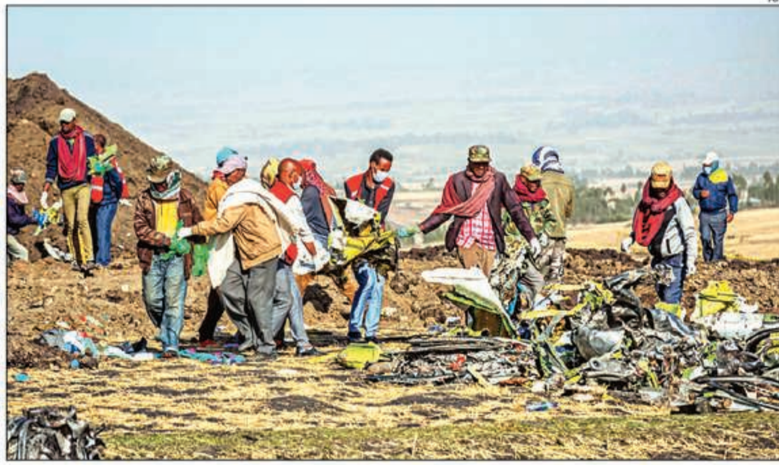
Rescue workers sift through the wreckage of a Boeing 737 Max 8 crash near Bishofto, Ethiopia, on Monday

Investigators seeking to find the cause of the crash discovered the black box with both the cockpit voice recorder and digital flight data on Monday, Ethiopian state TV said. Boeing's share price dropped 10% in early trading on Monday at the prospect that two such crashes in such a short time could reveal flaws in its new plane. The 737 line, which has flown for more than 50 years, is the world's best-selling modern passenger aircraft and viewed as one of the industry's most reliable.