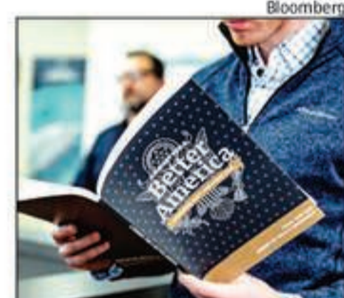
Trump's budget has little chance of becoming law because Congress controls spending, and Democrats control the House

Trump's budget, the largest in federal history, called for defence spending to rise by nearly 5% to $750 billion — which is more than the Pentagon had asked for — and an additional $8.6 billion for construction of a border wall with Mexico. The budget for wall is more than six times what Congress gave him for border projects in each of the past two fiscal years, and 6% more than he has corralled by invoking emergency powers this year after he failed to get the money he wanted.