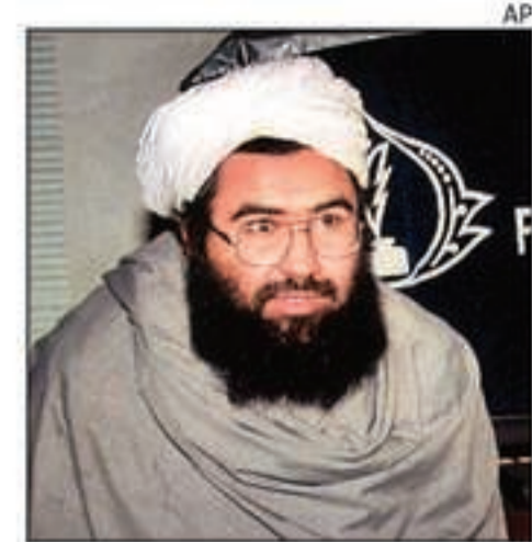
The US, the UK and France have moved a proposal at the UNSC after the Pulwama terrorist attack to designate JeM chief Masood Azhar as a global terrorist

Asked about India's appeal and China's stand on the issue, Chinese foreign ministry spokesman Lu Kang told media here, "First I would like to say that the UNSC as a main body of the UN has strict standards and rules of procedures. Some reports have knowledge of inside information the UNSC. I don't