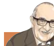
FALI S. NARIMAN

The Official Secrets Act has no place in a democracy, as the Goswami Commission had suggested in the late 1970s