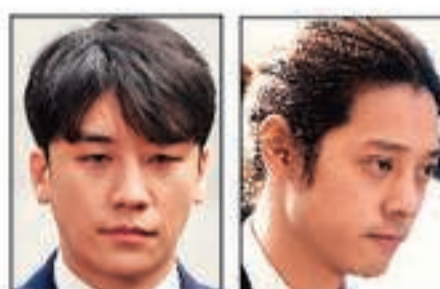
Seungri and Jung Joon-young were in a group chatroom where secret sex tapes were shared, and men joked about drugging and raping women

Seoul: Police in South Korea questioned two K-pop stars and two other singers resigned on Thursday, as accusations of sex tapes, prostitutes and secret chat about rape rocked the music industry and hit entertainment stocks.