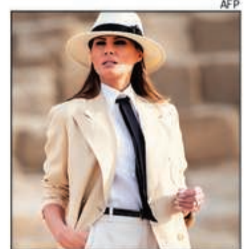
Trump had recently criticised the negative press coverage of his wife Melania, saying: 'If I were a Democrat instead of a Republican, she'd be Jackie O (Jacqueline Kennedy Onassis) times twenty'

Washington: US President Trump is not amused by the #FakeMelania conspiracy theories circulating on social media. He spun off a new theory on Wednesday to debunk the idea that there's a body double of his wife who steps in for her at times. The "fake news" did it, he claimed without evidence. Trump alleged on Wednesday in a tweet that photos of his wife had been altered to make them appear as though a look-alike accompanied him to Alabama last week to survey tornado damage.