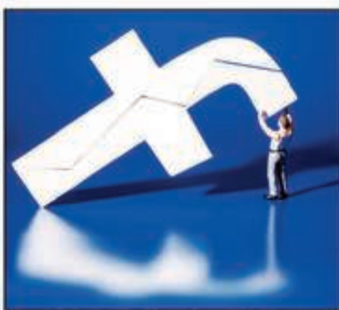
Facebook subsidiaries — Instagram and WhatsApp — also experienced interruptions across the world

In one of the biggest cases of outage, Facebook was down for about 24 hours across the world between Wednesday and Thursday. At the time of the filing of this report, the website had been restored in many parts of the world. On a live outage chart put out by a technology website, India looked alright but not entirely unaffected.