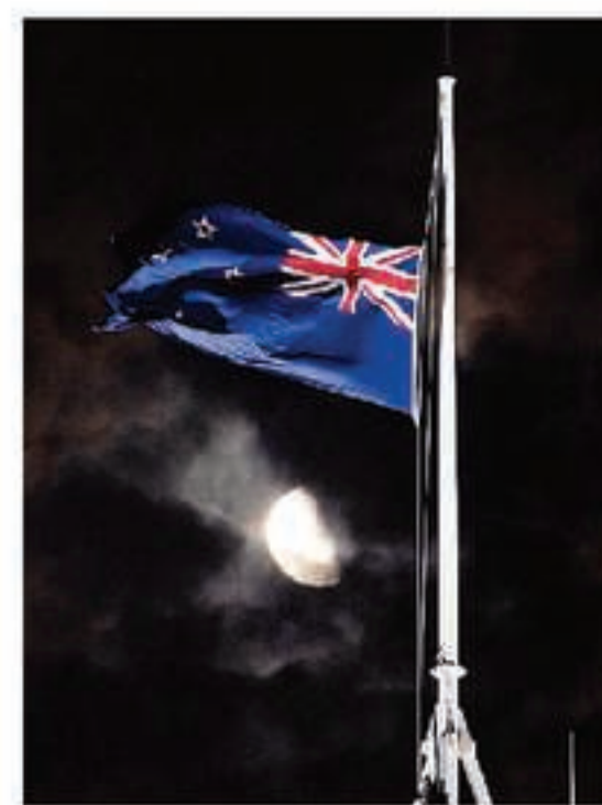
The New Zealand national flag flown at half-mast. Inset below: One of the gunmen