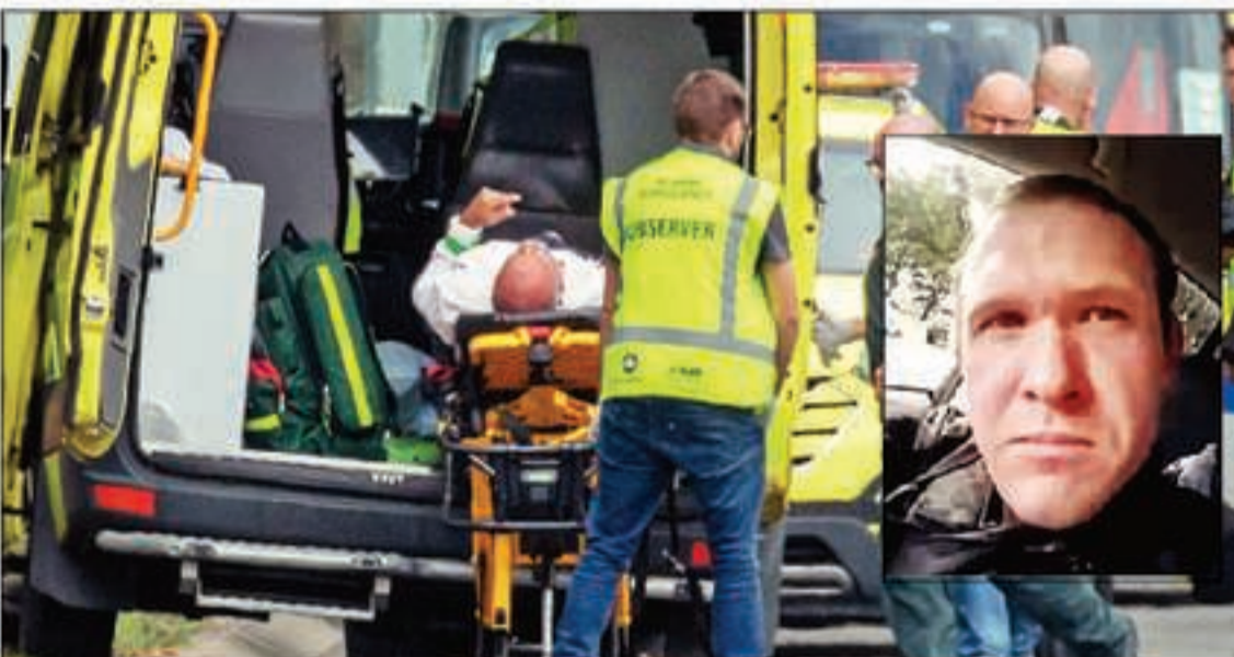
Ambulance staff take a man from outside a mosque in Christchurch

in the Mosques. 49 innocent people have so senselessly died, with so many more seriously injured. The US stands by New Zealand for anything we can do. God bless all!" Trump wrote on Twitter. The gunman's manifesto praised Trump as "a symbol of renewed white identity and common purpose".