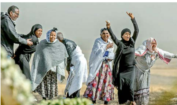
Ethiopian relatives of crash victims grieve at the site where the Ethiopian Airlines Boeing 737 Max 8 crashed shortly after takeoff on Sunday killing all 157 on board, near Bishoftu, south-east of Addis Ababa, on Thursday.

As families wait for the results from the investigation into the cause of the crash, Ethiopian Airlines is planning to hold a service on Sunday in Addis Ababa, at the Kidist Selassie, or Holy Trinity Cathedral, where many of the country's past