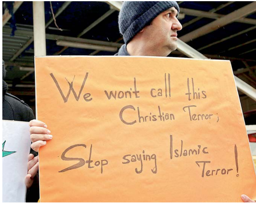
A Turkish man holds a placard as people demonstrate for the people killed during the mosque attacks in New Zealand, during a protest in Ankara, Turkey, on Saturday.

But, he said, New Zealand Muslims still felt at home in the south Pacific nation. "My children live here" he said, adding, "we are happy". —AFP