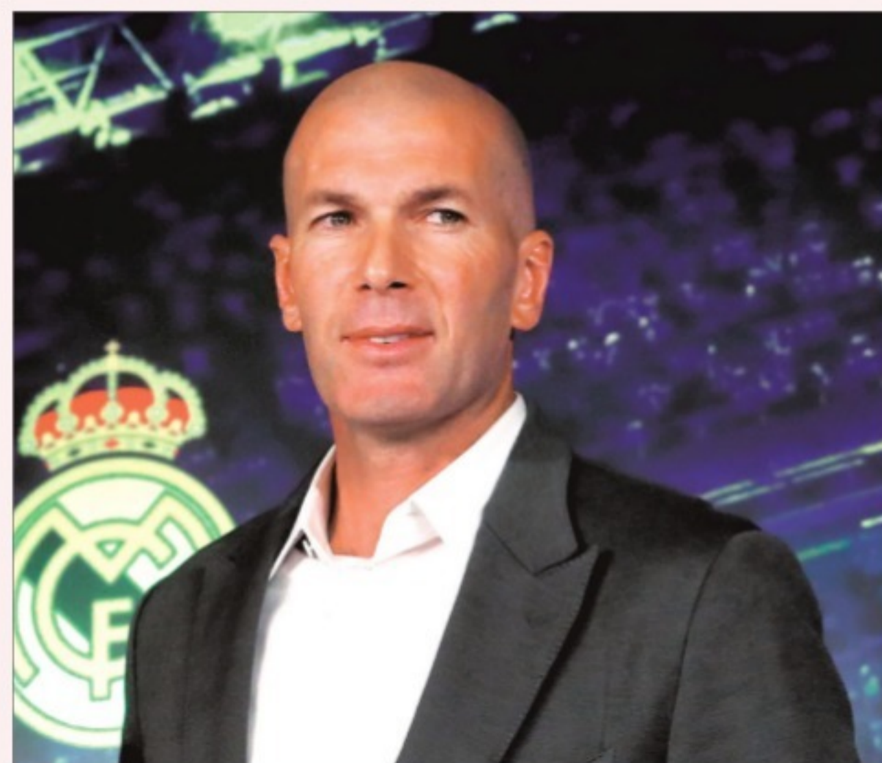
New Real Madrid coach Zinedine Zidane after a press conference announcing his return, in Madrid, Spain

Over to Zidane, who had left the club just nine months ago, much to the play-