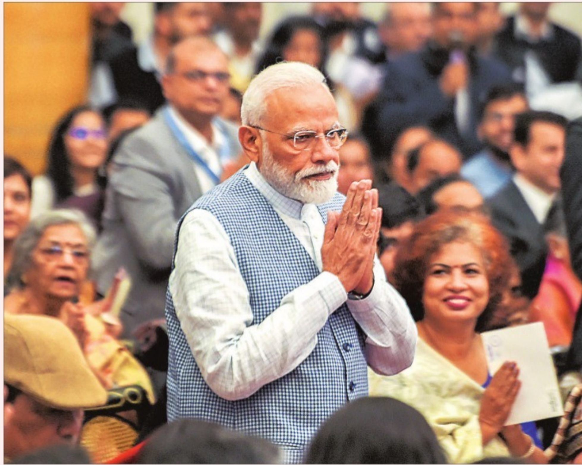
Prime Minister Narendra Modi at Rashtrapati Bhavan in New Delhi