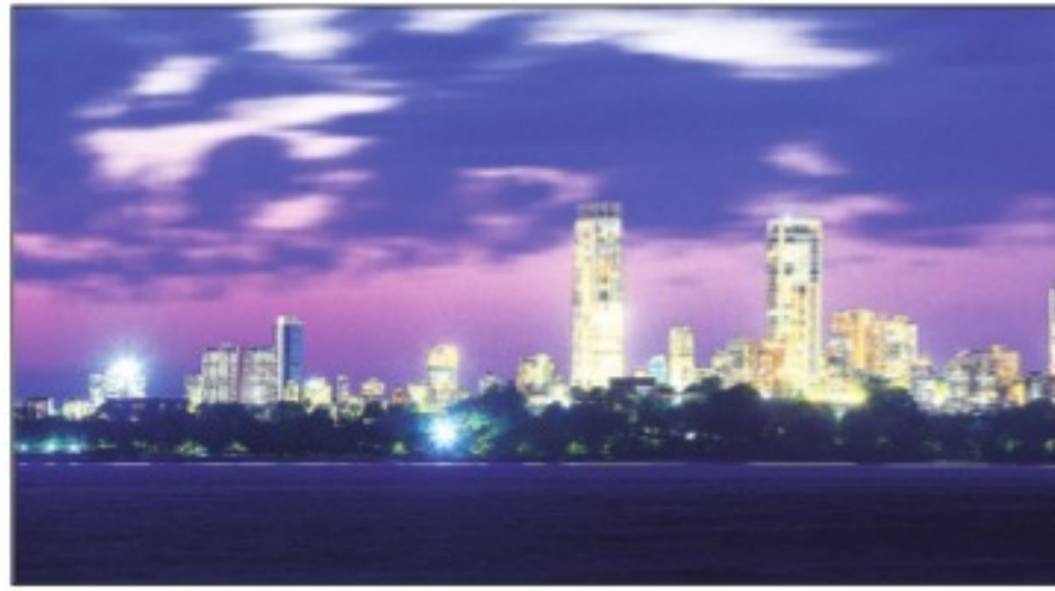
There are at least 20 cases before MahaRERA in which home buyers have complained against builder for delay.