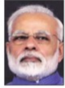
'He was an unparalleled leader, a true patriot and exceptional administrator'

EXPRESS NEWS SERVICE NEW DELHI, MARCH 17