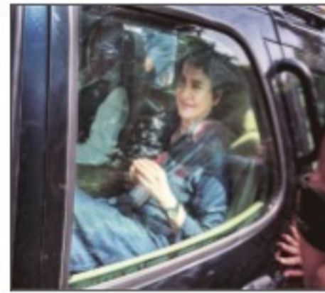
Priyanka Gandhi in Lucknow on Sunday.

Referring to the Ganga River as the symbol of "Sacchayi" (truth) and "Sammanata" (equality) and also symbol of our "Ganga-Jamuni culture", Priyanka said she was taking the river's help to reach to the people. "Ganga Sacchayi aur Sammanata ki prateek hai. Ganga humari Ganga-Jamuni sanskriti are chih hai. Weh kisi se bhedh bhav nahi karti. Gangaji Uttar Pradesh ka sahara hai. Main Gangaji ka sahara lekar bhi apke beech pahunchungi." (Ganga is the symbol of truth, Ganga Jamuni culture. It does not dis-