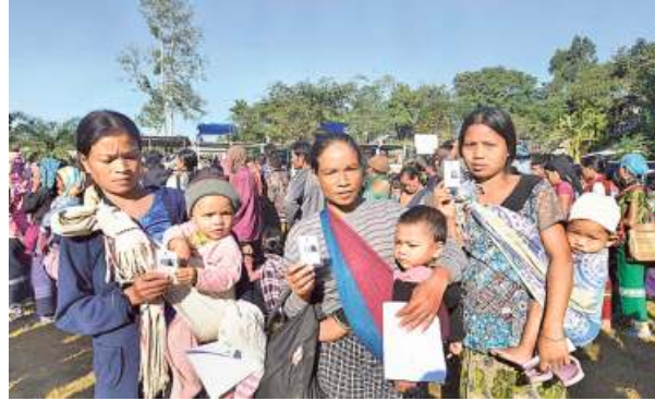
Bru women at a polling station at Kanhmun, Mizoram.