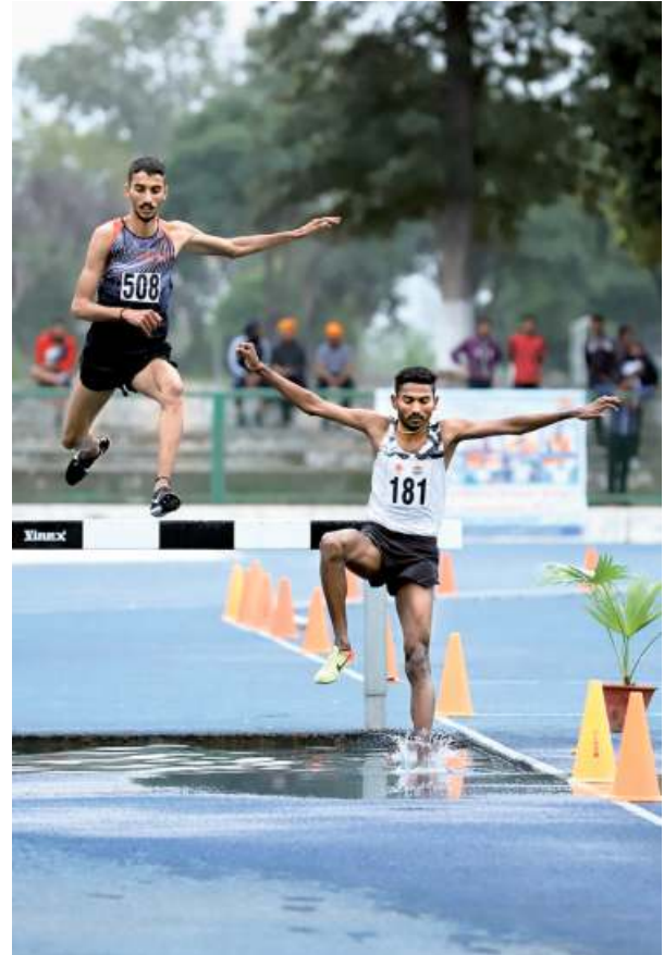
Remarkable effort: Avinash Sable, right, on his way to breaching the 8 minutes, 29 seconds barrier in the steeplechase on Monday.

Arokia Rajiv bests Muhammed Anas in 400m; disappointment for Dutee and Hima