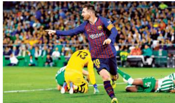
As easy as that: Lionel Messi did what he does best, score by the bucketful, this time against Real Betis.