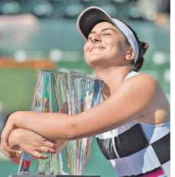
The Indian Wells triumph catapulted her to 24 in the latest WTA rankings, a jump of 36 spots from the previous week

Age: 18 Birthplace: Mississauga, Ontario, Canada Plays: Right-handed Turned Pro: 2017 WTA Titles: 1 Win/Loss record: 117/46 CAREER HIGHLIGHTS Winner: Indian Wells, 2019 Finalist: Auckland, 2019