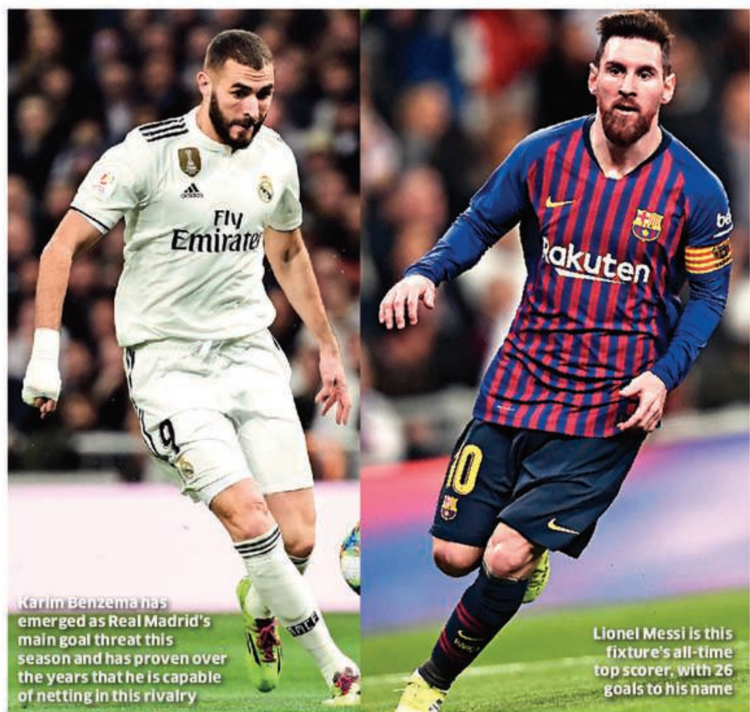
Karim Benzema has emerged as Real Madrid's main goal threat this season and has proven over the years that he is capable of netting in this rivalry

They are a settled side, probably settled for such a long time now, and they are very good players. All those things go a long way to why they are so successful in India in particular AARON FINCH explains why India are such a dangerous opposition