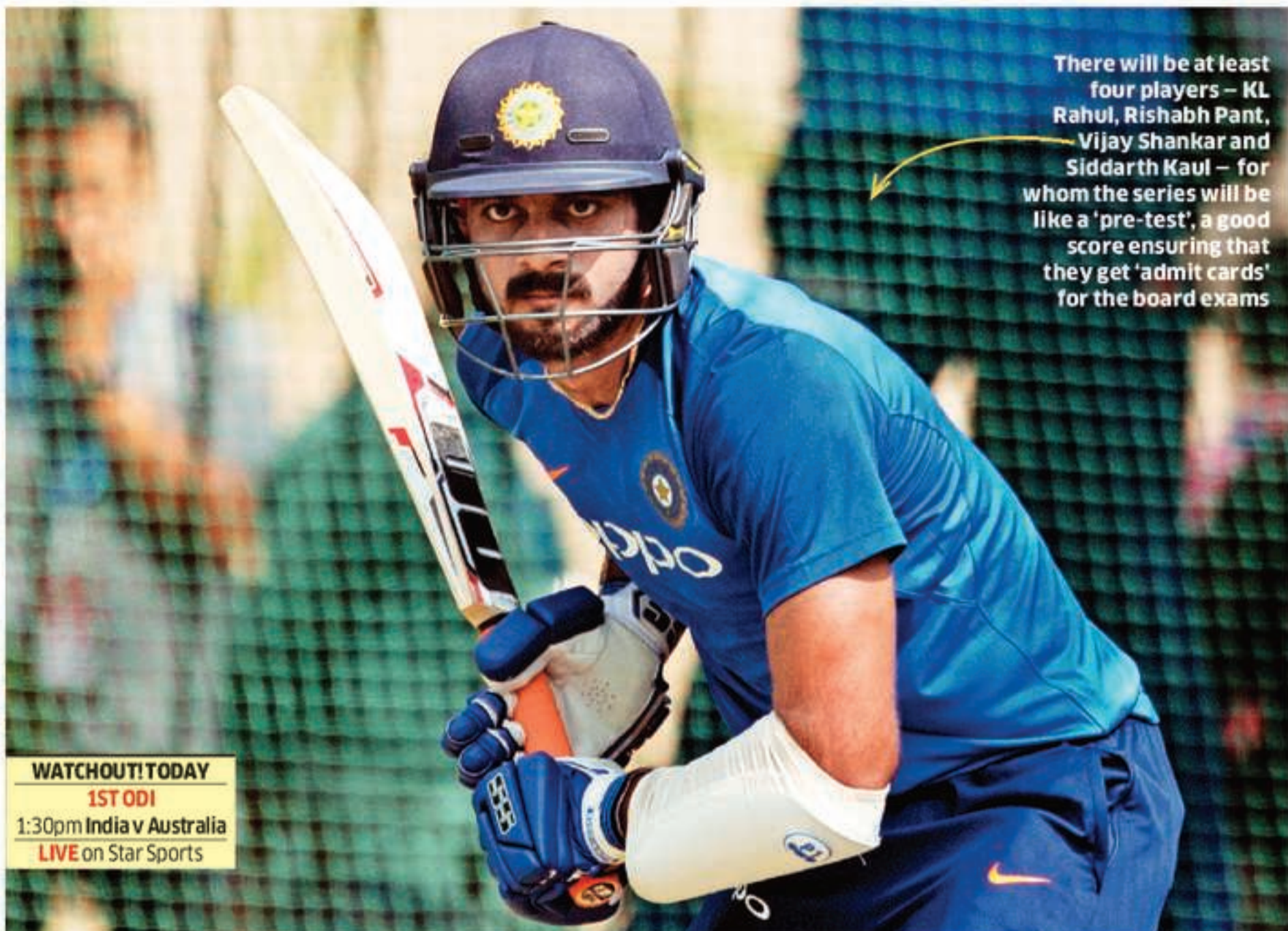
WATCHOUT! TODAY 1ST ODI 1:30pm India vs Australia LIVE on Star Sports

With Ambati Rayudu, Kedarr Jadhav and Shami back in the Indian set-up, the ODI series will be a completely different