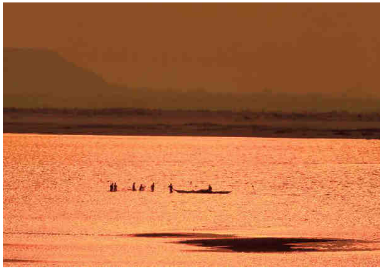
Fishermen busy catching fish in the Mahanadi river in Odisha. • BISWARANJAN ROUT