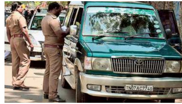
Taking no chances: Policemen, part of the flying squad of the Election Commission, have intensified checking of vehicles across Tamil Nadu.

Of the 21,899 licensed arms registered in the State, 18,768 have been deposited with authorities. Besides, 63 of them have been impounded and 32 licences cancelled. Arms in the custody of the police, security agencies and