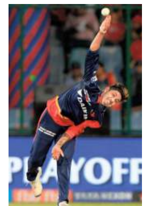
Lamichhane. •

Delhi Capitals' up-and-coming leg-spinner Sandeep Lamichhane has received advice from the master of the craft, Shane Warne, who asked him to bowl with a "big and brave heart".