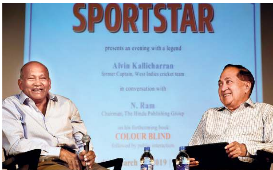
Trip down memory lane: Alvin Kallicharran and N. Ram share a laugh during their free-wheeling interaction on Thursday.

When posed a question about the title of the book,