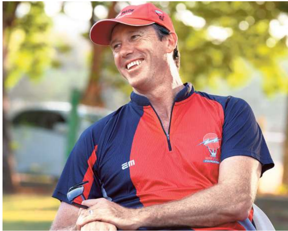
Legendspeak: Glenn McGrath reckons the IPL will be good for the players' mindset in the lead-up to the World Cup.

He has had an incredible start to his Test career. It's now how you back that up in the second year once the players have seen you and I am looking forward to seeing that. With respect to Tests,