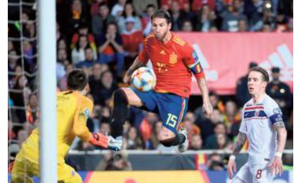
Saviour: Skipper Sergio Ramos came to Spain's rescue again, his Panenka penalty securing all three points against Norway.