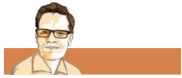
RASMUS KLEIS NIELSEN

It is not only social media that is responsible for it, but also news media and some politicians