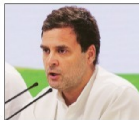
Rahul Gandhi announces minimum income scheme

Nyay scheme is beginning of the final assault on poverty, says Rahul Gandhi