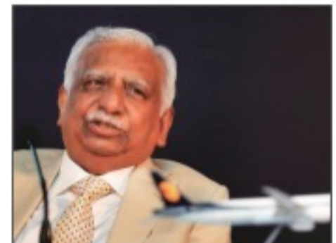
Naresh Goyal, Jet Airways chairman