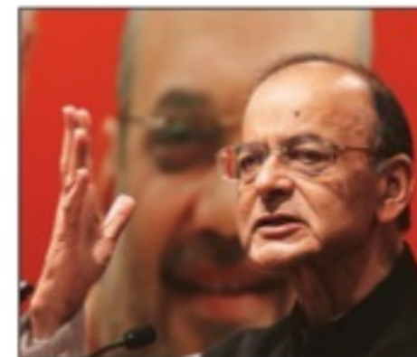
Jaitley at a press conference Monday.

HOURS AFTER Congress president Rahul Gandhi promised a minimum income scheme guaranteeing Rs 72,000 a year to the poor, Union Finance Minister Arun Jaitley Monday criticised the announcement, saying the Congress has a "history of swindling people in name of poverty alleviation"