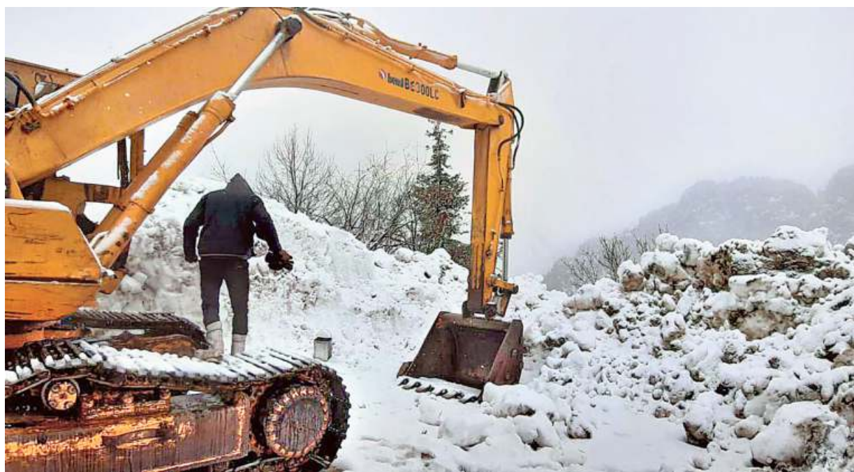
Mission Rohtang: The Border Roads Organisation removes snow from the Manali-Leh Highway, in Manali, on Monday. Five BRO teams have been deployed to clear snow on the highway.