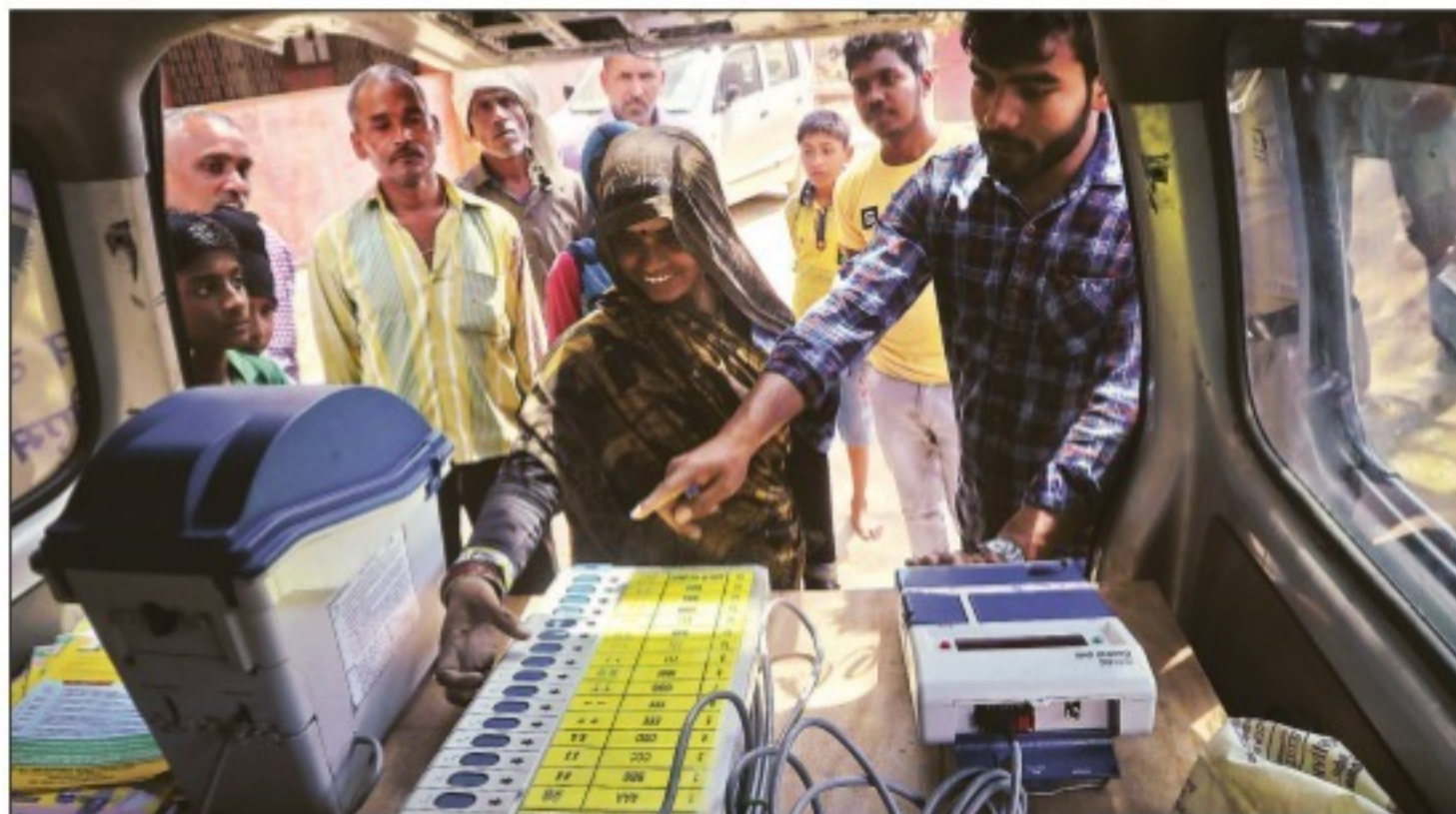
An electoral official demonstrates the functioning of an Electronic Voting Machine (EVM) and Voter-Verifiable Paper Audit Trail (VVPAT) in Daryaganj, Delhi, on Tuesday.

The Model Code of Conduct (MCC) forbids the use of "government transport including official aircraft, vehicles, machinery and personnel" for CONTINUED ON PAGE 2