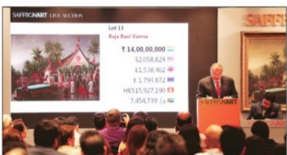
Gaitonde to Raja Ravi Verma: auction in Mumbai Tuesday

In the end, the Gaitonde painting turned out to be the most expensive pick, and the fourth highest ever for one by the artist. In all, according to SaffronArt, the collection fetched Rs 60.9 crore — the tax department will receive Rs 54.84 crore