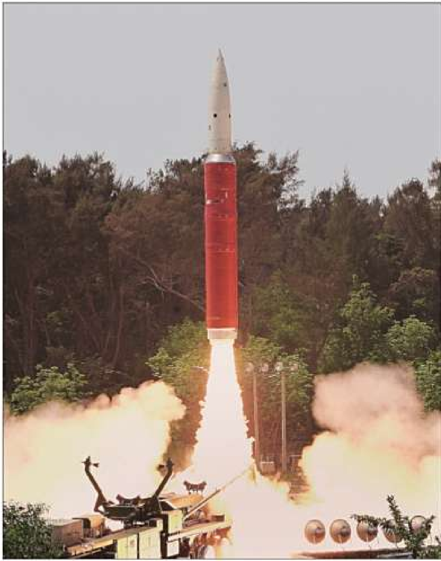
The BMD Interceptor takes off from the Dr A P J Abdul Kalam Island, off Odisha.