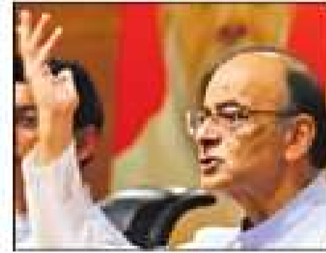
Arun Jaitley in New Delhi on Wednesday. Prem Nath Pandey

BECOMING THE fourth country in the world to shoot down a satellite in space with an anti-satellite missile, New Delhi Wednesday put itself in a position of advantage when it comes to framing global rules in the future on the prevention of an