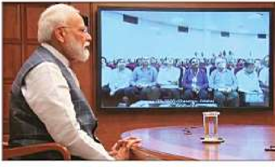
PM interacts with Team Mission Shakti on Wednesday.

The EC, however, directed a committee of four officers Wednesday to examine the mat-