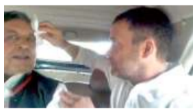
Rahul Gandhi with the injured scribe.