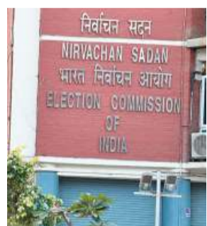
The EC reiterated the need for declaring donations.

It said these amendments would pump in black money for political funding through shell companies and allow "unchecked foreign funding of political parties in India which could lead to Indian