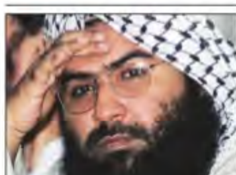
US MOVES TO BLACKLIST MASOOD AZHAR PAGE 9