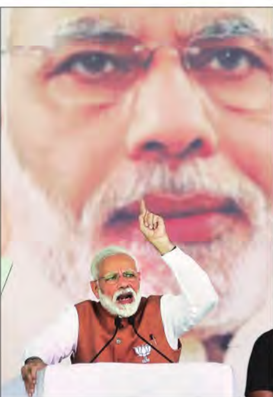
Prime Minister Narendra Modi at a rally in Meerut on Thursday