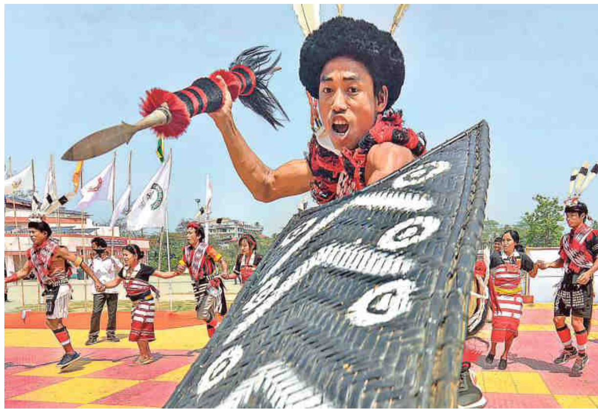
Artistes from Northeast performing during the '4th Ethnic Cultural Meet' in Guwahati on Thursday. •PTI