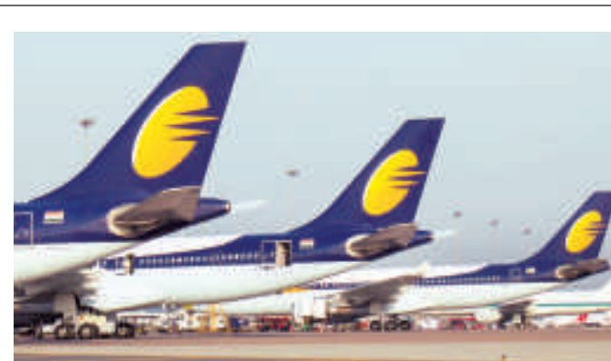
Pilots' union says there'll be no flying unless airline provides a road map