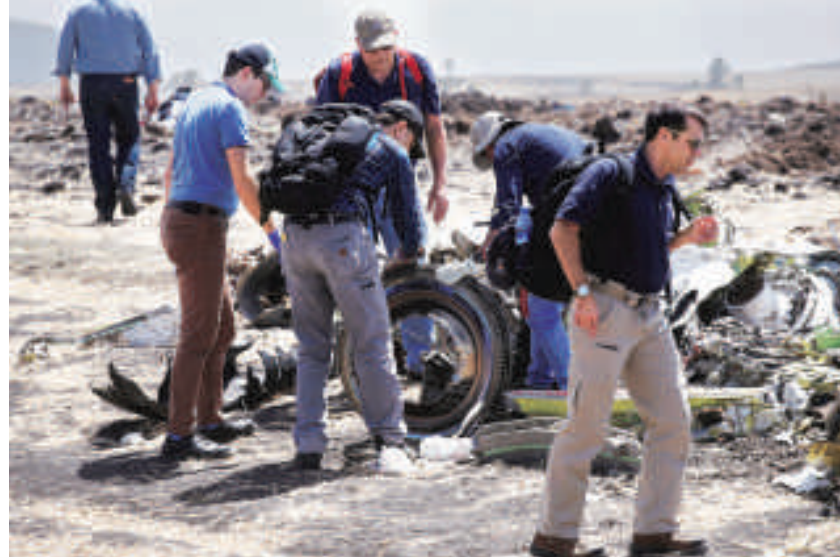
American civil aviation and Boeing investigators search through the debris at the scene of the Ethiopian Airlines Flight ET 302 plane crash near the town of Bishoftu in Ethiopia on March 12