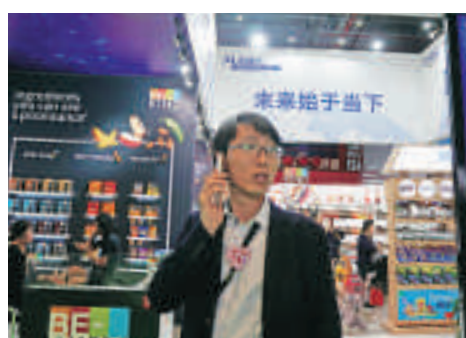
5G is the next generation of cellular technology with download speeds that are 10 to 100 times faster than 4G LTE networks

Shanghai has developed what it claims to be the first district boasting both 5G coverage and a broadband