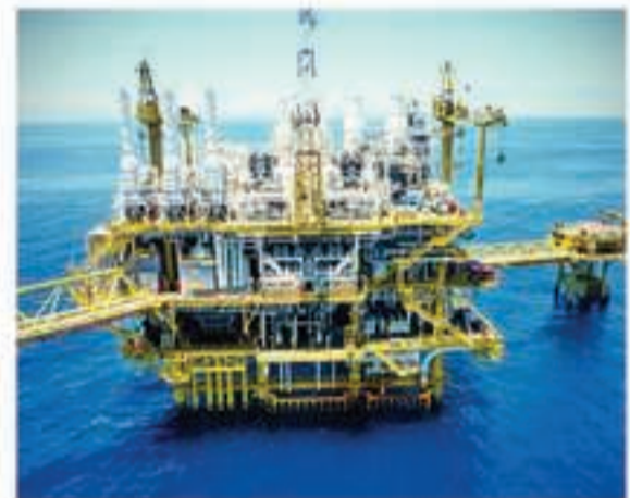
Offshore oil rig

A government proposal is expected to sail through parliament. Sovereign funds are state-owned investors in various kinds of assets that aim to generate revenue for government programmes and pensions.