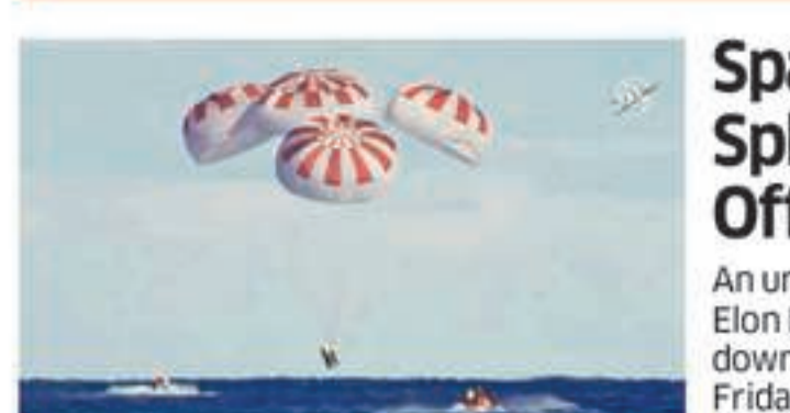
SpaceX capsule splashdown

An unmanned capsule from Elon Musk's SpaceX splashed down into the Atlantic Ocean on Friday morning after a short-term stay on the International Space Station, capping the first orbital test mission in NASA's long-delayed quest to resume human space flight from US soil later this year. After a five-day mission on the orbital outpost, Crew Dragon autonomously detached about 2:30 am EST (07:30 GMT) on Friday and sped back to earth reaching hypersonic speeds before an 8:45 a.m. EST (13:45 GMT) splash-down in the Atlantic, about 200 miles off the Florida coast. A SpaceX rocket launched the 16-foot-tall capsule from the Kennedy Space Center in Florida last Saturday. The first-of-its-kind mission, ahead of SpaceX's crewed test flight slated for June, brought 400 pounds of test equipment to the space station, including a dummy named Ripley, outfitted with sensors around its head, neck, and spine to monitor how a flight would feel for a human. Reuters