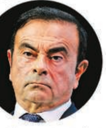
Lawyer representing Ghosn