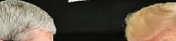
Tim Cook and Donald Trump