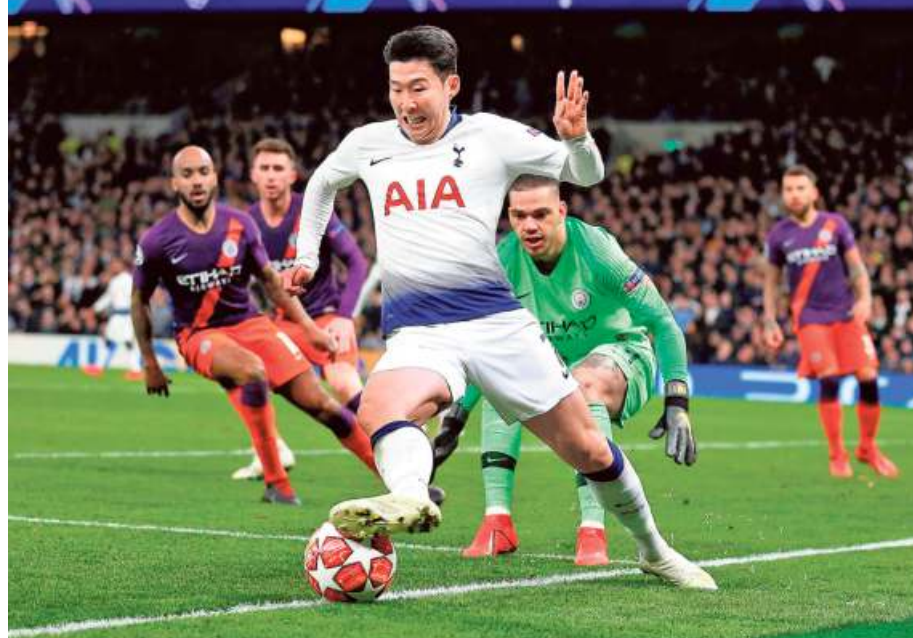
Priceless: Son Heung-Min's clinical strike late in the second half gave Tottenham a much-needed edge over City.

Tottenham overcame Harry Kane's latest injury woes as Son Heung-Min sealed a priceless 1-0 win over Manchester City after Hugo Lloris saved Sergio Aguero's penalty in a dramatic Champions League quarter-final first-leg on Tuesday. Mauricio Pochettino's side earned a slender advantage thanks to Son's clinical strike late in the second half at the Tottenham Hotspur Stadium. While Son soaked up the plaudits, much-maligned keeper Lloris also enjoyed a sweet moment of redemption in a troubled campaign when he kept out Aguero's first-half spot-kick.