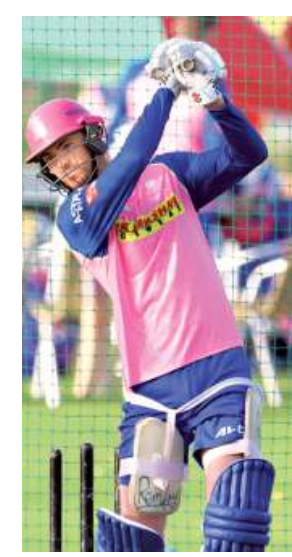
Ashton Turner.

On the morning of December 19, 2018, Ashton Turner woke up at 3 a.m. to the news that he was picked up by Rajasthan Royals at the IPL auction. It would take another three months for the world to wake up to his talent. With an astonishing 84 not out off 43 balls, he led Australia to a four-wicket victory against India in the fourth ODI at Mohali in March. Chasing a daunting 360, the visitors had needed 131 from 83 balls when he arrived at the fall of the fourth wicket. Thirteen balls were still left when he hit the winning runs, and he playing in only his second ODI. That innings suddenly made the ₹50 lakh Royals spent on him look like a bargain. He is still to make his IPL debut, though. Baffled "To be honest, I was initially baffled when I got to know that I was picked by Rajasthan Royals," Turner told The Hindu . "It was pretty exciting news to wake up that morning." The 26-year-old said he