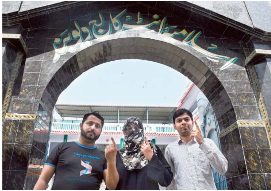
Power of democracy: Voters show their inked fingers at Islamia Inter College in Deoband during the first phase of polling on Thursday.

"The silence is also because we have no options. We know that the SP-BSP-RLD alliance is a majboori ka gathbandhan (an alliance of desperation). And we are being asked to vote because the