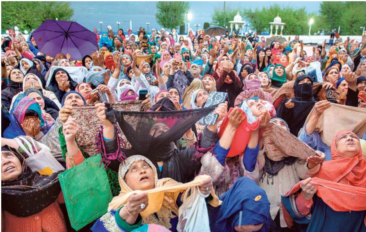
Kashmiri women praying at the Hazratbal shrine on the outskirts of Srinagar on Friday on the occasion of Mehraj-u-Alam.